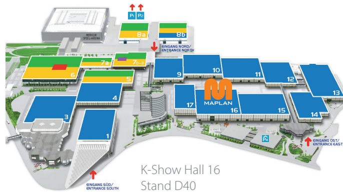
K-Show Hall 16 Stand D40